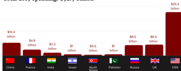
Total 2019 spending: $72.9 billion

This year marked the 75 th anniversary of the U.S. bombings of Japan with nuclear weapons, an attack that killed close to a quarter million people by the end of 1945. Remembrance is inseparable from recognition that nuclear weapons are not yet history. They are still here . The threat of nuclear war is real and growing . As of April 2020, there were approximately 13,410 nuclear weapons in the world held by 9 countries. In 2019, these 9 countries spent $72.9 billion dollars on nuclear weapons, more than $138,000 a hour. These costs are primarily based on the cost of warheads and delivery systems and development alone to permit comparison across nations. Other estimates that include verifiable costs of all nuclear programs that would not be spent if nuclear weapons did not exist, calculate the true costs of nuclear weapons in 2020 in the U.S. alone to be on the order of $67.595 billion .