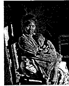
A RWANDAN CHILD ORPHANED BY AIDS WITH HIS GRANDMOTHER.